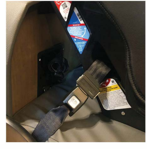
RUN LAP BELT THROUGH BACK OF CAR SEAT AND SECURE. TIGHTEN AS NEEDED.