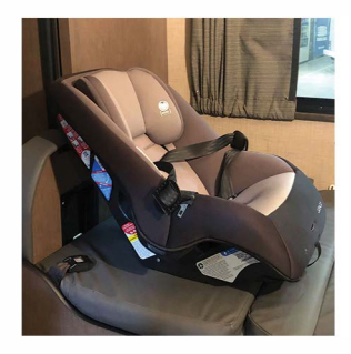
LOWER DINETTE AND PLACE CHILD SEAT ON DINETTE BENCH FACING FORWARD