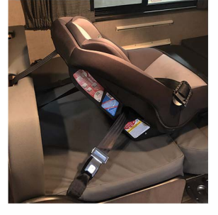
WHEN CHILD SEAT IS BEING INSTALLED. TETHER AND LAPBELT ATTACHED (BUT NOT CINCHED)