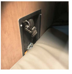
TOP TETHER ATTACHED TO LOWER TETHER